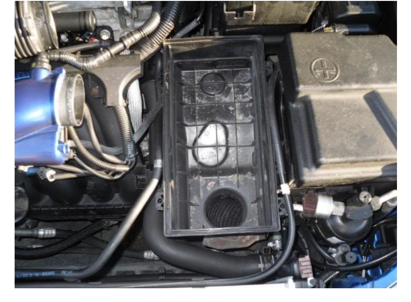
nice pile of bits will be on your drive now