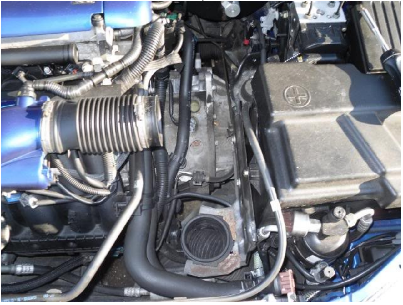
remove the old induction pipe(it unclips from the main bracket)